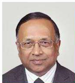
Hon. Pradeep Agarwal CMD Cotton Corporation of India