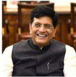
Hon. Piyush ji Goyal Minister of textiles