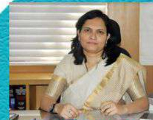
Hon. Sheetal Ugale Textile Commissioner of Maharashtra