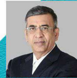
Hon. Ashokbhau Jain Jain Irrigation (Chairmen)