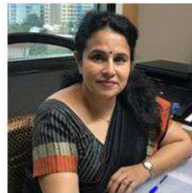
Hon. Roop Rashi Textile Commissioner of India