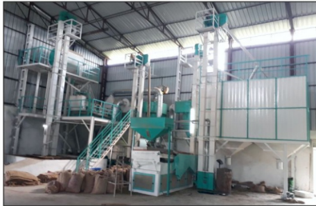
Automatic Cleaning Plant (Filter Plant)