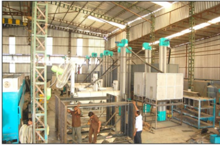
Round Grader Automatic Dall Mill

Email : babaengineeringworks51@gmail.com info@babaengineeringworks.com Website : www.babaengineeringworks.com