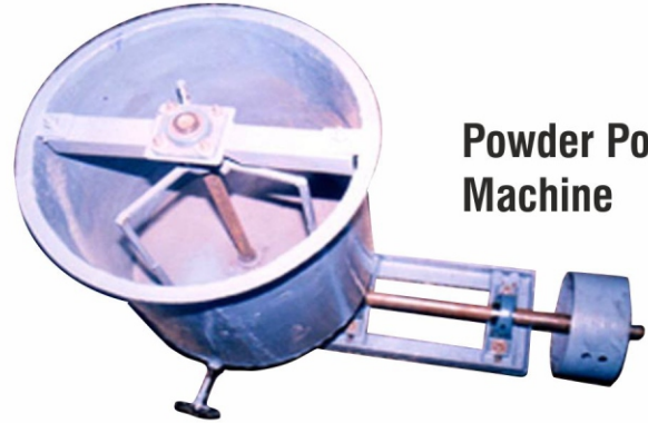
Powder Polish Machine