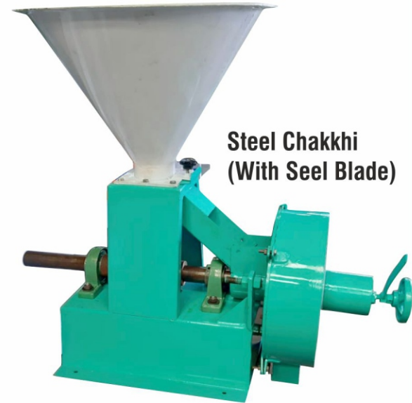
Steel Chakki (With Seel Blade)