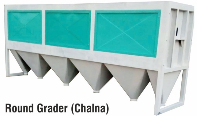
Round Grader (Chalna)