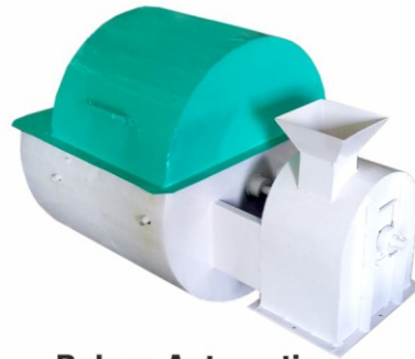
Pulses Automatic Oil Dumper