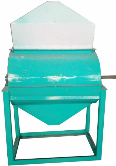
Dall Phatka Machine